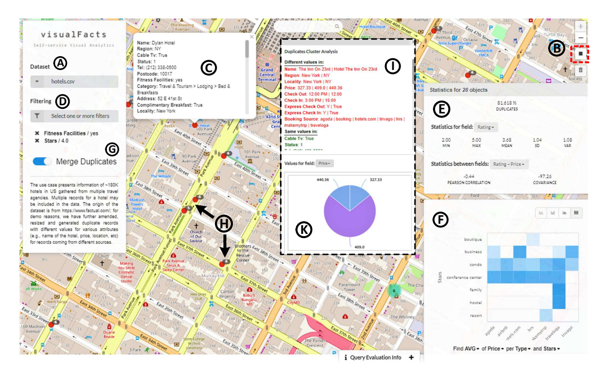
Figure 2: VisualFacts UI Overview

bivariate statistics (e.g., the Pearson correlation, covariance). The statistics are computed for the data points being visible in the entire window or the selected rectangle area and refreshed following every user action on the map (e.g., pan, zoom). In Figure 2, univariate statistics are presented for the hotel rating field, and bivariate for the rating and price fields.